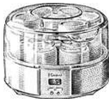
EUROCUISINE AUTOMATIC YOGURT MAKER