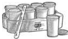
DONVIER ELECTRIC YOGURT MAKER